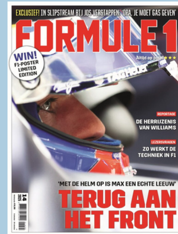
Magazine 11x yearly