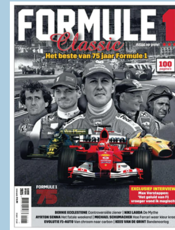
Special 2x yearly